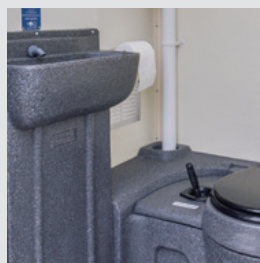
Toilet wash area