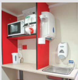
Well equipped canteen