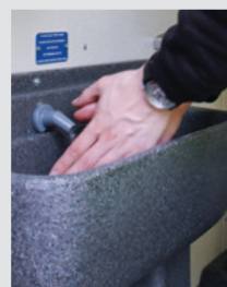
Delivery of hot water