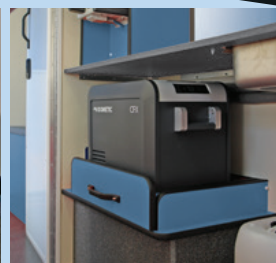
12V cool box/ fridge