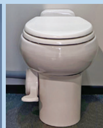
Low flush eco toilet