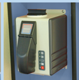
Hot drinking water system