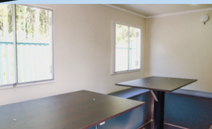
Spacious seating area