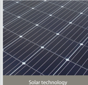
ery of not water Solar i