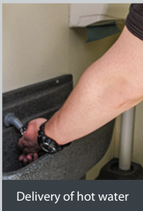
Delivery of hot water