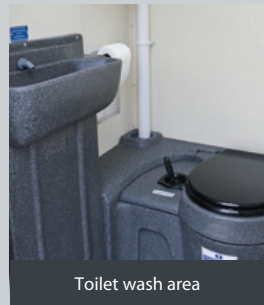
Toilet wash area