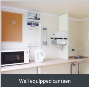
Well equipped canteen