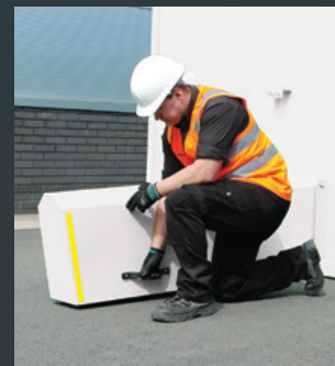
Close & lock canopy to protect towing facility