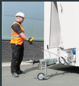
Unhitch from towing vehicle and operate hydraulics using the push button controls

Fast deployment time means more time on the job, making it the money saving choice of welfare unit for rental companies and contractors.